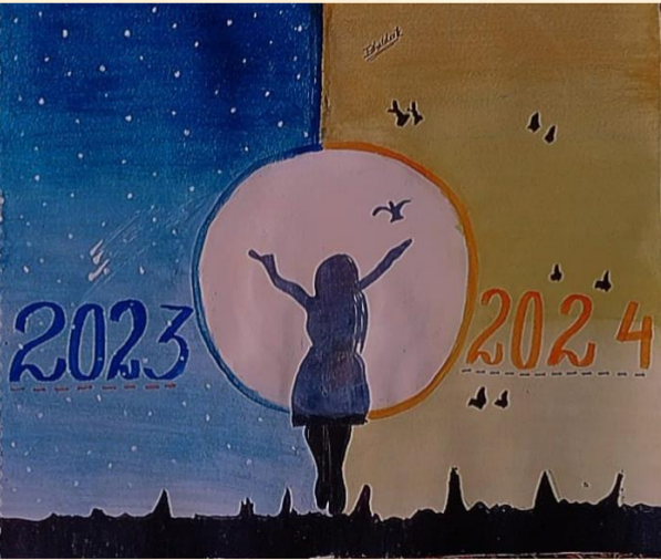
By Ishita Halder VIII B