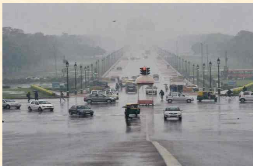
Stage IV of the Graded Response Action Plan (GRAP). However, experts warn that the situation could worsen during Diwali due to the use of firecrackers.

The government is actively tackling this issue by enacting measures such as the odd-even vehicle plan, temporarily closing schools for in-person classes, and adhering to