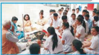
HAWAN TO MARK THE DAY

An Inter- House Quiz on "Our Constitution" was conducted for the students for the classes IV-V on April 15, 2015. The purpose of the same was to make the students aware of the Framing of Our Constitution, its history and its goals - Democracy, Socialism, Secularism and National Integration. Five Question Rounds were conducted. Sarojini Naidu House bagged I position, Radha Kishanan House bagged II, followed by Kalpana Chawla and C V Raman. The event concluded with a message that rights and duties go hand in hand.