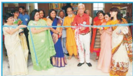
OPENING OF THE EXHIBITION