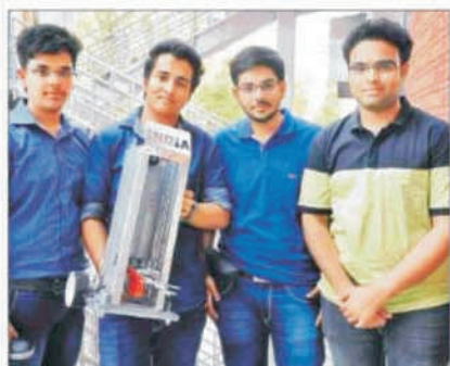
स्टोर्ट जो लोडिंग को लेकर बनाया स्टोर्ट मेंडोर के रूप में जो छत फिगन होता, ऑनियन टर्नर, काल काल्ड व निवेल काल्ड

pick up props if placed in certain area without manual interference. It was mentored by Mobile Phone and had inbuilt sensors which could easily identify the structure and then assemble it using cranes. Mecatronics, the other Robot was a manually controlled Robot which used the Blue tooth technology with a fork lift and picked up props and assembled them. The total time duration for the run was 4 minutes. The Robotics Team successfully completed the run and bagged the First Position at the Senior Level of the competition. Team India was sponsored by Intel Corp. Inc.