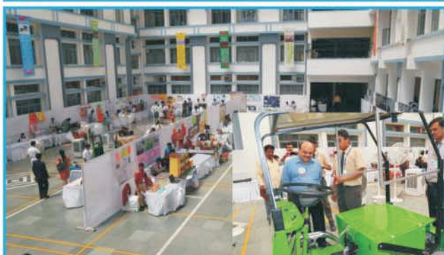
OVERVIEW OF THE EXHIBITS

sub- themes namely; Community Health and Environment, Landmarks in Science and Mathematics, Information and Communication Technology, Energy Resources and Conservation, Transport, Agriculture and Waste Management. Around 284 schools from all over India participated in this mega event. Innovative and talented students exhibited their models. Eminent personalities from the field of education formulated the renowned jury to adjudge their scientific skills. The students were provided a unique learning platform to exhibit their vision into reality. The efforts of students were lauded not only by revered guest and judges but also the school students who had come for the stall visit on the last day of the Exhibition. It was a great learning experience for all.