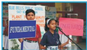
EMPOWERING RIGHTEOUS KNOWLEDGE

A special assembly was organized by the students of class V A on April 15, 2015 to commemorate the birth anniversary of the 'Father of Indian Constitution', Dr. B.R. Ambedkar. The assembly aimed at making the students aware of the contribution of Dr. B.R. Ambedkar in the making of our constitution and to sensitize them towards their responsibilities. Baisakhi was celebrated with a Folk Song Activity by Class III.