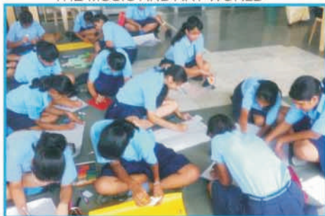
COLLABORATIVE EFFORT & LEARNING