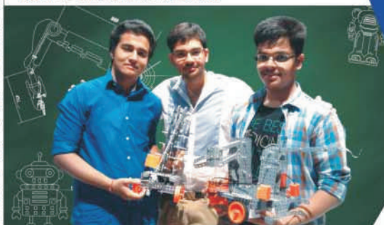
A Team with only one dream- that has come true! To showcase the capabilities of India at an International level (Seen above with their invention at Seattle, USA)

The Management, Director, Principal and staff of Blue Bells Public School congratulate the Robotics Team of the School for having achieved the position of overall winners at International Robotics Competition "IRC Open League" held at University of Washington, Seattle, USA.