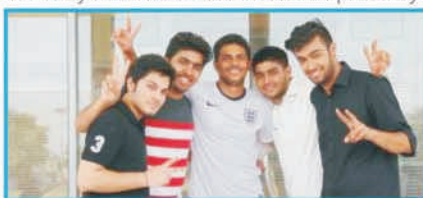
Students with Aggregate Above 90%